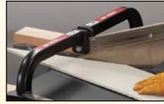
Scribe desired angle on fiber cement siding plank and feed it into the guillotine blade as you cut.

3/12, 4/12, 6/12, 8/12, 10/12 or 12/12 pitch cuts and most other angles, in fiber cement siding.