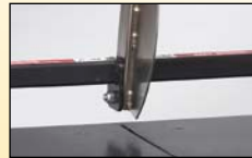
The blade is anchored above the large guillotine plate to allow clearance for cutting any angle in 5/16" (8 mm) fiber cement planks up to 12" (305 mm) wide.

Stable welded frame will survive the most rugged job-site environments.