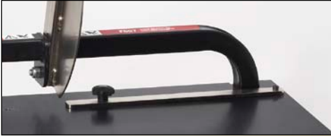
A 90° guillotine fence is quickly installed to the left or right of blade for cutting siding planks to length.