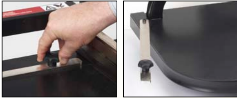
Loosen knob to swing fence out of the way for angled cuts.

Cut multiple angles in Fiber Cement Siding with Guillotine Precision and Minimal Dust!