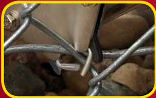
Clinching mechanism brings ring forward for easy access.