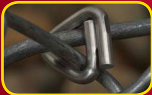
Unique overlap clinch for stronger, more secure connections.