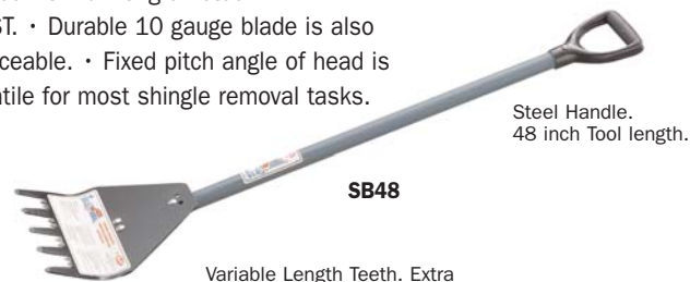
Steel Handle. 48 inch Tool length.

Rugged 48 inch long all steel BEAST. • Durable 10 gauge blade is also replaceable. • Fixed pitch angle of head is versatile for most shingle removal tasks.