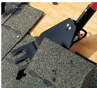
Extra long teeth get under shingles.

Shingle removal is a beast of a job but now, finally, there's a tool that's up to the task. THE BEAST Shingle Remover from Malco makes a tough job bearable. THE BEAST cleanly lifts off heavy loads of shingles and pulls nails in one motion. Long handled models are available with either an adjustable head for handling any roof pitch, or a versatile fixed head . Adjustable models also feature fiberglass handles and a choice of 48 or 58 inch tool lengths. All long handled BEASTS feature replaceable 10 gauge tempered steel blades with variable length teeth . A comfortable D-grip is also standard.