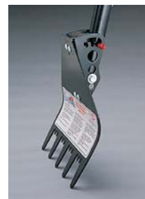
Adjustable Position 3