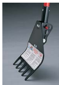
Adjustable Position 1

• 3 position head makes this BEAST ideal for handling any roof pitch. • Choice of 48 or 58 inch tool length. • Heavy duty, but lighter weight, fiberglass handle for exceptional balance and control.