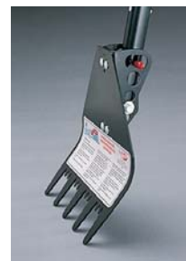
Adjustable Position 2